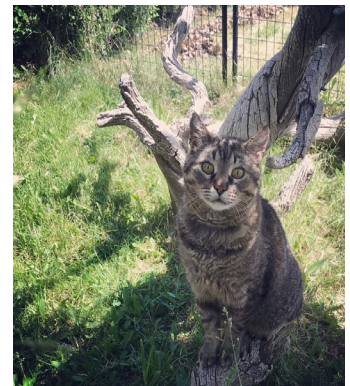
Adoptable Beauregard, Male 6 years, enjoying one our 'catios'