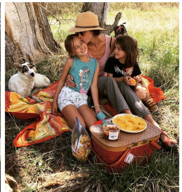
Pigeon with her new family