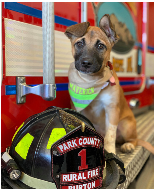
Maverick reporting for duty at the fire station. Right: happy adoption day!