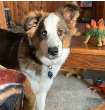
Pictures, from left to right: Top Row: Bottle Baby Zion; Bryce (Moe) Happy Adoption! Middle Row: Rainier (Annapurna) and Arches (Eroy) on a play date; Glacier in her element Bottom: Kenai was born to love the snow; Yellowstone (Jake) is a beautiful mix with 1 blue & 1 brown eye