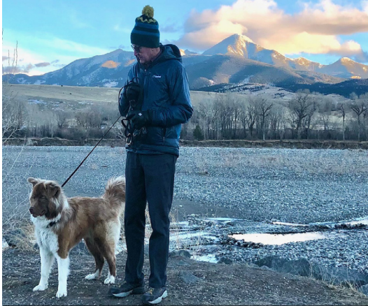
Bobby B, now Carson, was nursed back to health by a wonderful foster family and was lucky enough to find a forever home at the same time!