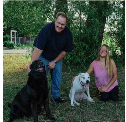
Lando arrived at Stafford still healing from his eye and nose injuries resulting from being pepper sprayed while left alone and seeking help on the property he was rescued from. After some time to relax at the shelter and feel safe again, Lando found his new family and new doggie sibling, and is HAPPY!