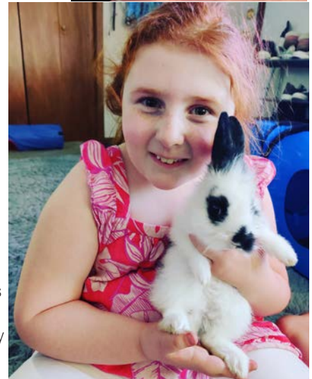
(Left) The shelter's Zoo has been a temporary home to a variety of critters including parrots and rats; Adopters post celebratory photos of their beloved exotics, like for Waffles the Bearded Dragon's birthday!; (Right) Blueberry arrived injured, rescued from a busy Bozeman intersection by a concerned passerby, but soon after found a new home, where she is safe and loved!