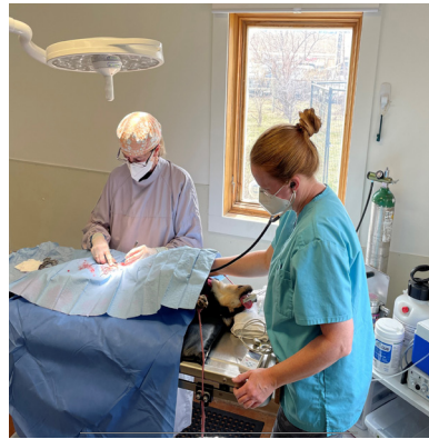
The shelter's veterinary team hard at work

This year we have had intakes for 190 animals through the 23rd of March. That is on par with the number of intakes for the same period a year ago. We are noticing that this year we have seen an increase of animals that have an injury or a condition that needs immediate medical attention. This fact made it evident that we need to upgrade our medical capabilities to keep up with the medical demands thrust upon us. We have invested in equipment that will help us deal with the many conditions we see that need diagnoses and treatment. Many of you know that we have embarked on a major initiative to offer our community alternatives to surrendering their animals to us. Greater Good Org. has designated us to be their distributor of pet food throughout central Montana. We also work to raise money to fund our Vet Assistance Program as well as providing counseling for behavioral issues. Good news—as of today the rate of surrendered animals is down 23% from the same period a year ago!