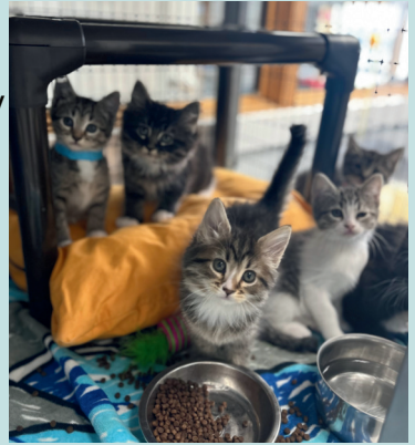
Rescued kittens waiting for their homes at Stafford.

In these situations, immediate intervention is necessary. Stafford Animal Shelter is equipped to provide the care these vulnerable kittens need to survive and thrive.